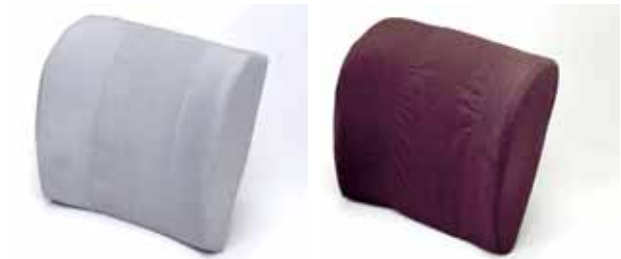
No. 6244 – Gray cover No. 6244-S – w/ back strap No. 6245 – Brown cover No. 6245-S – w/ back strap