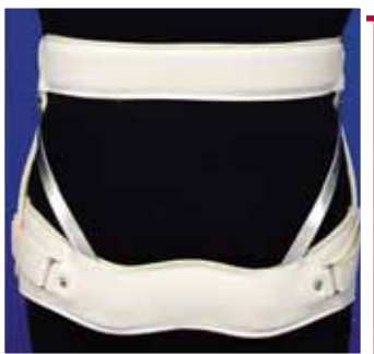
MODEL 949 WILLIAMS FLEXION ORTHOSIS

Sizes – Small: 29"-32" hips 11.5" posterior height Medium: 33"-36" hips 12.5" posterior height Med. Lge.: 37"-40" hips 13" posterior height Large: 41"-44" hips 13" posterior height