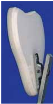
Swivel sternal pad used on models 1382 and 1384

Includes swivel feature on both sternal and suprapubic pads for total contact and to minimize pressure around the edges.