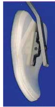
Swivel suprapubic pad used on model 1384