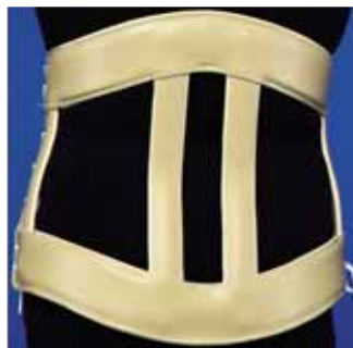
MODEL 962 CHAIR-BACK (KNIGHT) ORTHOSIS

Each size available in 9", 11" or 13" posterior uprights.