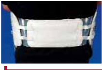
MODEL 950 HYPER- EXTENSION SPINAL ORTHOSIS

Provides anterior control in the thoracolumbar spine; indicated for compression fractures and post-fusion. Holds its controlling motion even when adjustments are being made. Sternal pad on swivel base, with fixed supra-pubic and lateral pads; thoracolumbar pad with polyethylene flanges. Adjustable posterior straps which incorporate positive screw-lock fastening mechanism. Oblique anterior aluminum frame with wide range of adjustability; completely washable.