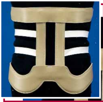
MODEL 963 LOW BACK SPINAL ORTHOSIS

Provides anterior and posterior control in the lumbar spine.