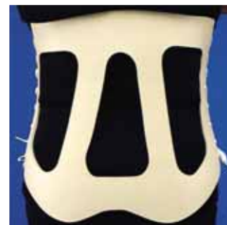
MODEL 952 KYDEX CHAIR-BACK ORTHOSIS

Provides anterior, posterior and lateral control in the lumbar spine.