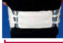
MODEL 926 HYPER- EXTENSION SPINAL ORTHOSIS

Sizes – Small: 17"-20" length, 34"-38" chest, 32"-36" hips Medium: 18"-21" length, 38"-44" chest, 36"-42" hips Large: 20"-23" length, 44"-50" chest, 42"-48" hips